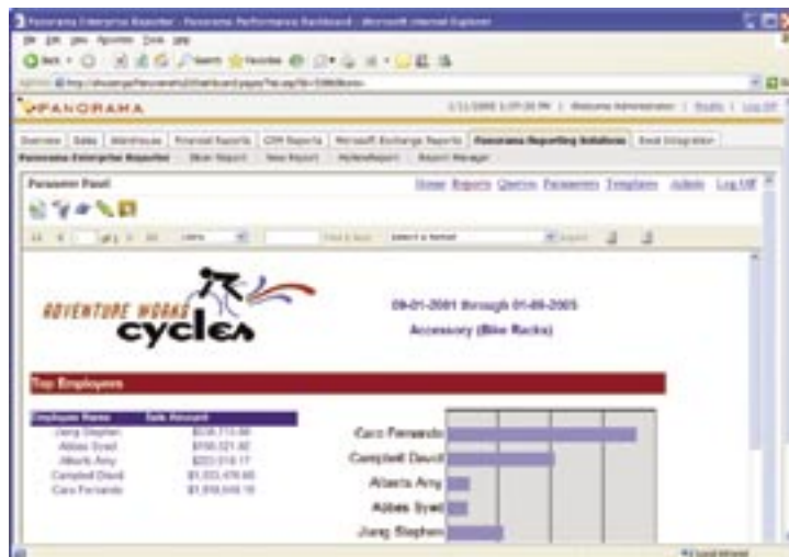
Easily create a variety of reports such as statements, production reports and financials

For more information: USA/Canada 1 877 709 5848 UK +44 (0)207 887 6300 Israel +972 3 648 0084 email info@panorama.com www.panorama.com